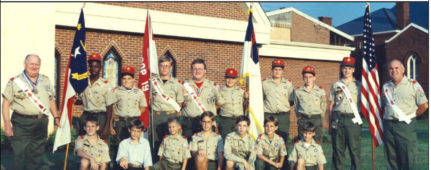
Troop 19 circa 1992